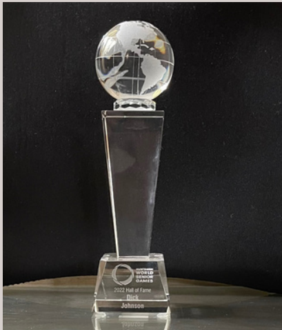
Huntsman Hall of Fame Trophy