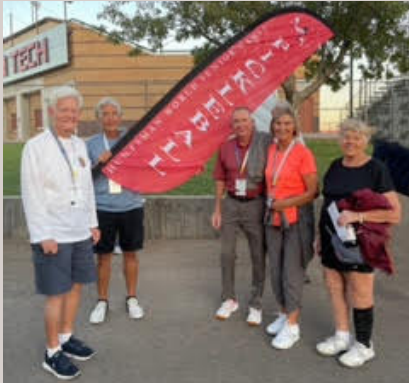
The 2022 Hall of Fame Inductees